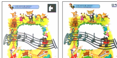
Fig. 2. (left) a page with a traditional fiducial marker, (right) a page with our page marker

In hybrid visual tracking, a page marker is just used for page identification not for camera pose estimation so that we can reduce the size of a marker and don't need to design the shape as rectangle or circle. Therefore, a page marker can be designed in various ways not giving visual discomfort. Fig. 2 shows that our page marker is very small compared with a traditional fiducial marker. Our marker size is only 2cm x 1.3cm. In addition, randomized trees support only one page and the system loads the trees for only the current page, so we can optimize the memory space and achieve fast matching and high correct matching ratio. Compared to fiducial marker tracking, keypoints spread widely, so more accurate and stable camera pose can be estimated.