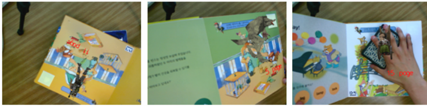
Fig. 4. Pose estimation under ( left and middle ) viewpoint changes, ( right ) serious occlusion

Table. 1 shows the average amount of time needed for a 2500 frame video clip for 15 pages. As expected, the page marker detection takes so little time that it does not have an effect on performance. After loading the tree data, only 22.49ms was needed to finish the pose estimation process. That means the proposed method can achieve 44.46 fps ideally.